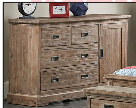
4 Drawer Dresser with Door 57W x 18.5D x 35H