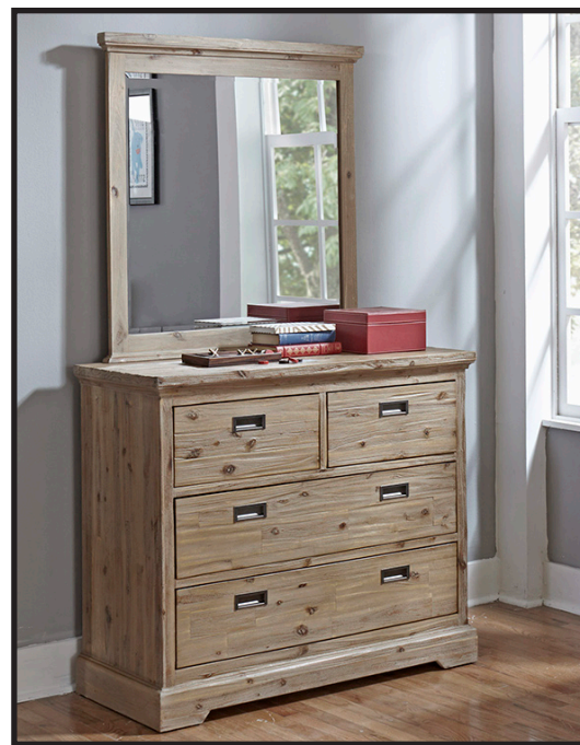
Mirror 37.25W x 37.5H