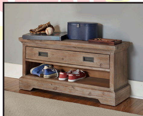
Dressing Bench 39.25W x 12D x 18.75H