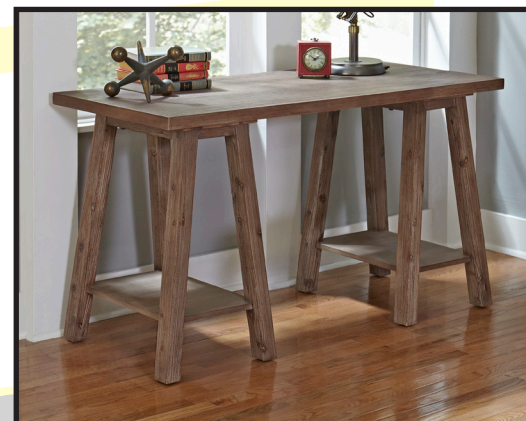
Desk 54W x 24D x 30.25H