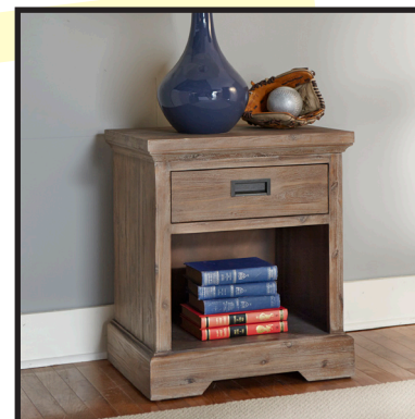
Nightstand 22W x 16D x 25H