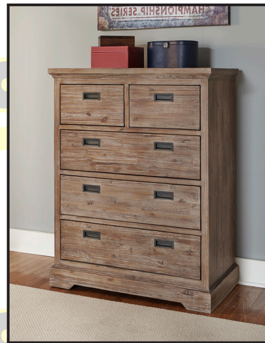
5 Drawer Chest 37.5W x 18.5D x 47.25H