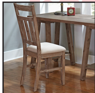
Chair 18W x 20D x 42.25H