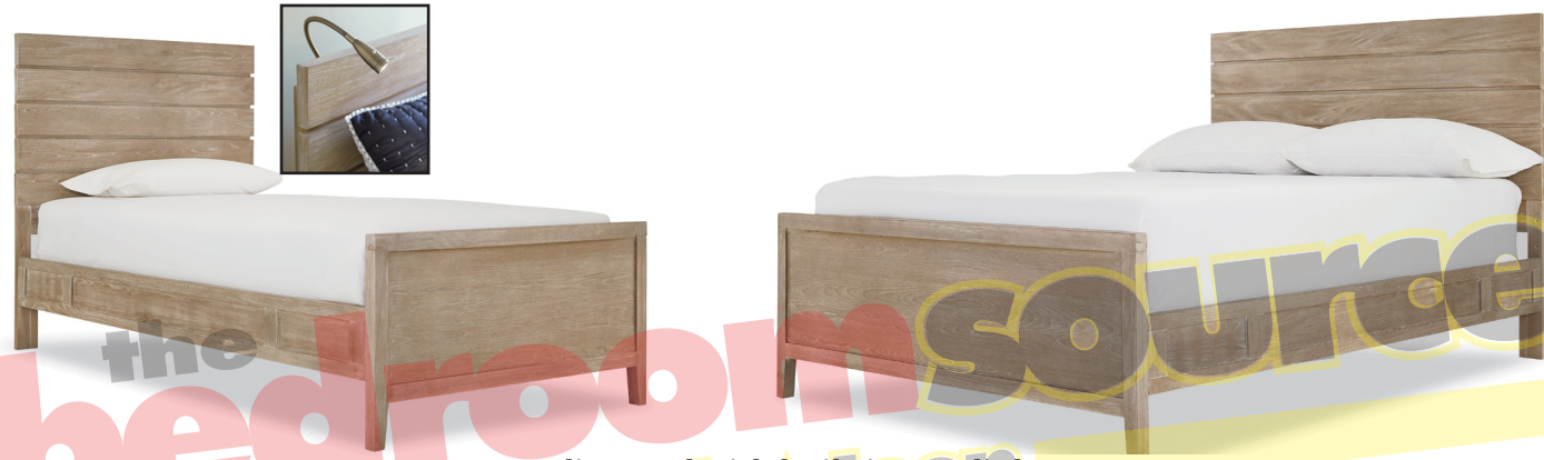
Reading Bed with built-in LED light Twin - 43W x 80L x 47H Full - 58W x 80L x 47H