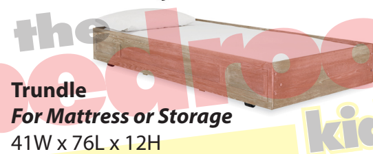
Trundle For Mattress or Storage 41W x 76L x 12H