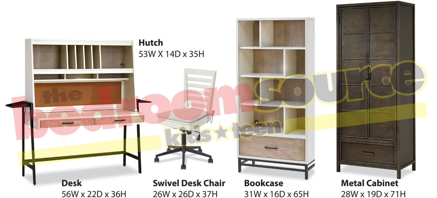
Desk 56W x 22D x 36H