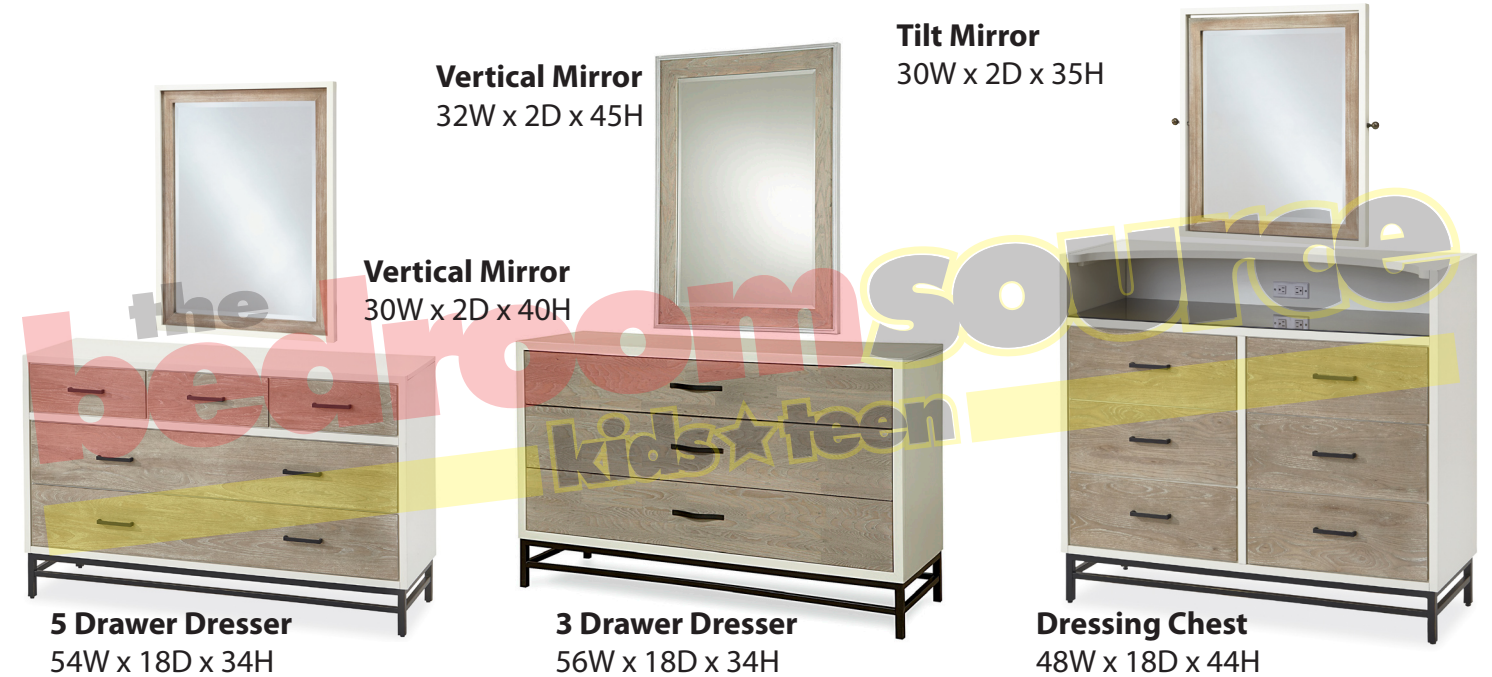
5 Drawer Dresser 54W x 18D x 34H