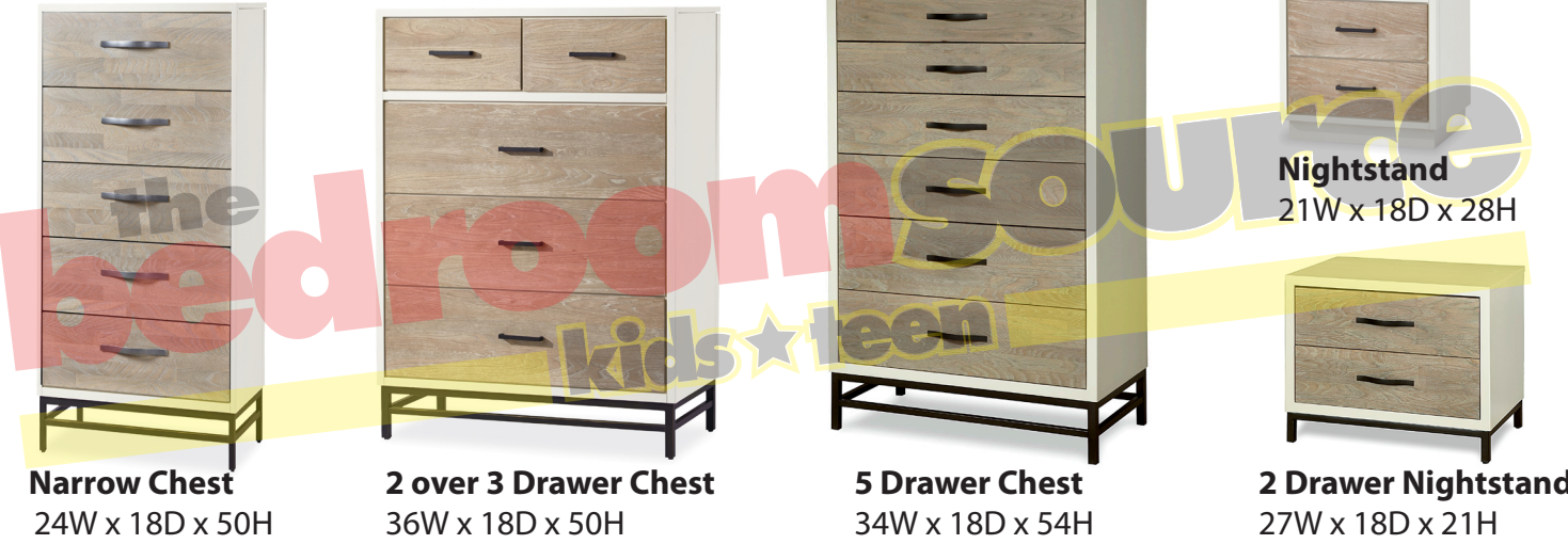
Narrow Chest 24W x 18D x 50H