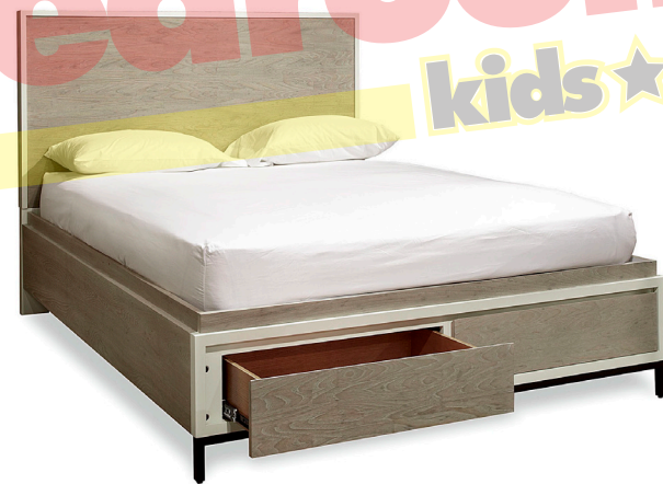
Platform Storage Bed Queen: 66W x 86L x 52H King: 82W x 86L x 52H