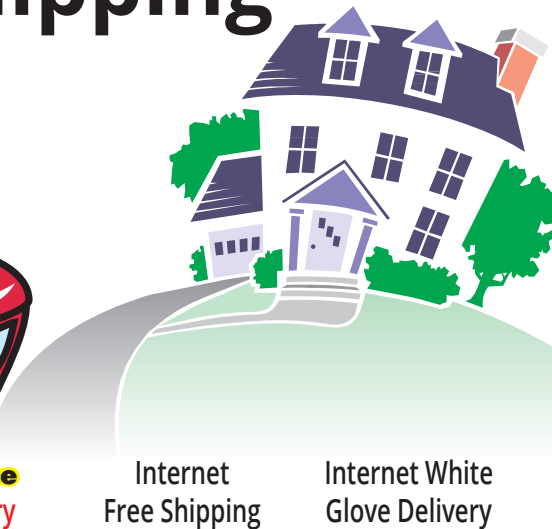
Internet Free Shipping