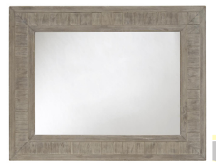
Key Biscayne Mirror 45W x 2D x 35H