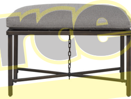
Metal Bench 30W x 15D x 19H