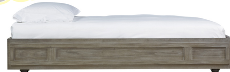
Trundle - For Mattress or Storage 41W x 76L x 12 H