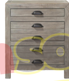
3 Drawer Nightstand 24W x 17D x 28H