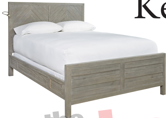
Reading Bed with built-in LED light

Twin - 42W x 80L x 48H Full - 57W x 80L x 48H