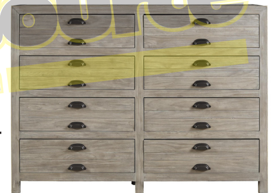
8 Drawer Dresser 60W x 19D x 44H