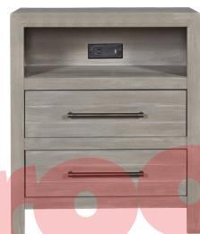
2 Drawer Nightstand 24W x 18D x 28H