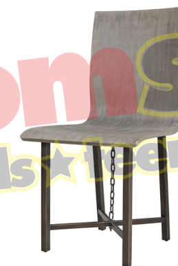
Desk Chair 19W x 21D x 37H