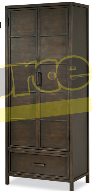
Metal Cabinet 28W x 19D x 71H