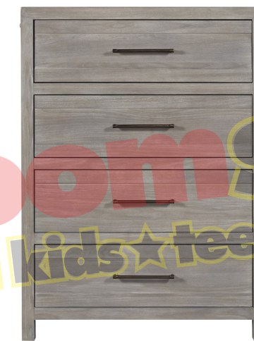
4 Drawer Chest 36W x 18D x 52H