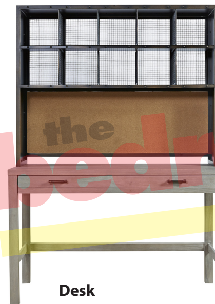
Desk 48W x 22D x 30H