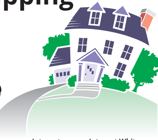
Internet Free Shipping