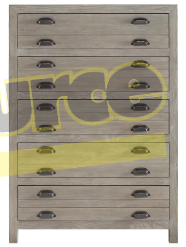
5 Drawer Chest 38W x 18D x 54H