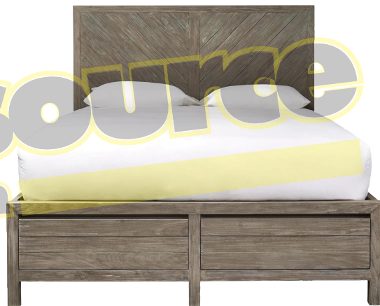
Platform Storage Bed

Queen - 64W x 87L x 56H King - 80W x 87L x 58H