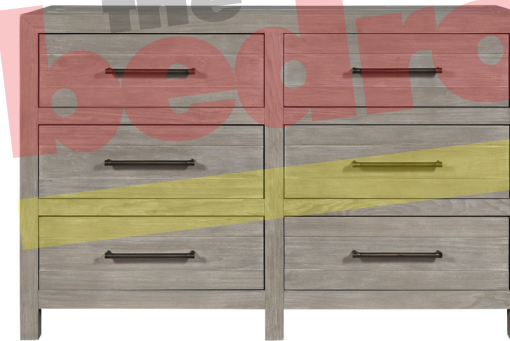
6 Drawer Dresser 54W x 18D x 35H