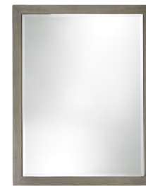
Vertical Mirror 30W x 2D x 40H