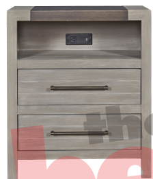
Metal Nightstand 24W x 16D x 28H

Queen - 64W x 87L x 56H King - 80W x 87L x 58H