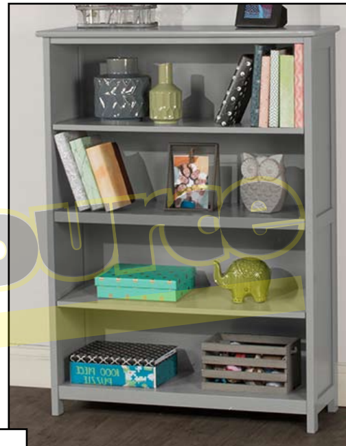
Bookcase 33"W x 11 5/8"D x 45"H