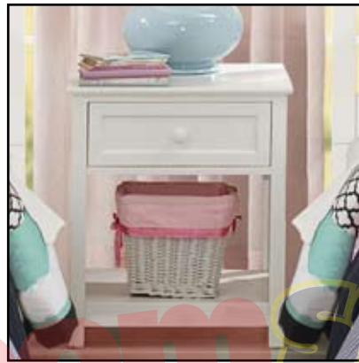
Nightstand 19"W x 14"D x 23"H