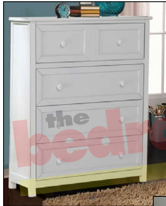
4 Drawer Chest 35"W x 16"D x 42"H